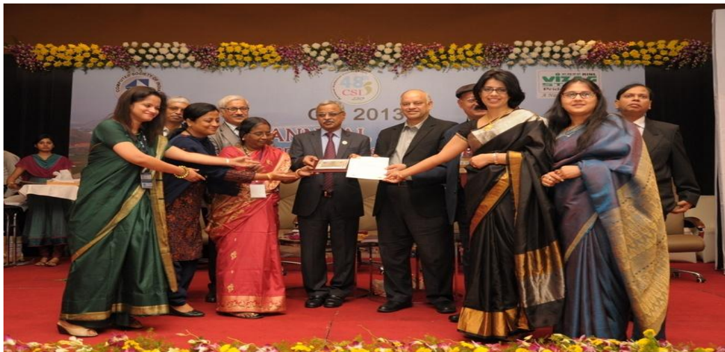
The DSIR team from Delhi receiving project award from Chief Guest with the President CSI

rich source of information which, individually and taken together are able to contribute much to understanding the e-Governance landscape of the Country. This year a Record number of 51 Projects from 18 States were Honoured with project awards during the awards functions including 5 appreciation for sustenance.